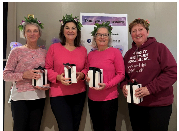
Event D – Team Fairy Good Curlers